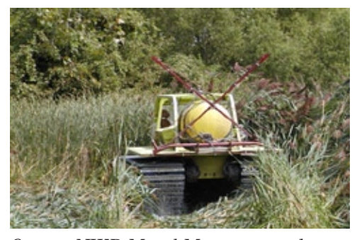
Ottawa NWR MarshMaster tramples invasive Phragmites stalks and opens up space for native species, getting a jump on impacts from a predicted drop in water levels in Lake Erie as a result of climate change.

The good news is that as we've thinned out these destructive plants and opened habitat, we've seen a resurgence in native species, including the reappearance of the endangered Eastern prairie fringed orchid. The Refuge population of the orchid is now one of the largest in the state of Ohio—a silver lining to the dark cloud posed by climate change.