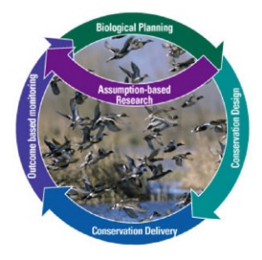
Element 1. Biological Planning: setting targets/goals

We take as a given that effective conservation always necessitates that we answer a few basic questions: First, what are our goals? What healthy populations of species do we seek to conserve, and what specifically are our targets? Second, how can we develop a conservation design to meet these goals? Third, how will we deliver this conservation approach? Fourth, what sorts of monitoring will be needed to determine whether we've been successful or whether we need to adapt our strategies? Fifth, what new scientific research do we need to meet our conservation objectives? These ideas are not new; they are key components of any adaptive management or landscape scale conservation strategy. Distilled, they become the five elements of Strategic Habitat Conservation (SHC):